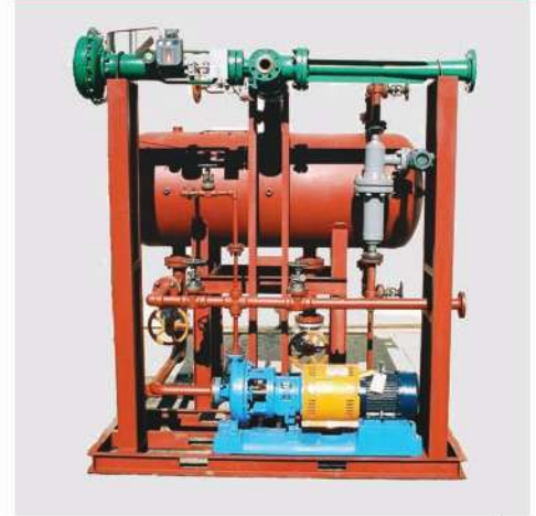
SEPARATOR, VACUUM RECEIVER, & CONDENSATE COLLECTION MODULES